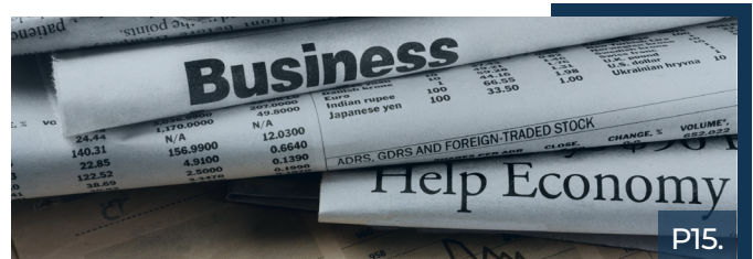
Selby Jennings' Risk Management Expertise