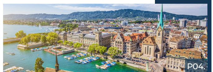
Salary Guidance - Zurich